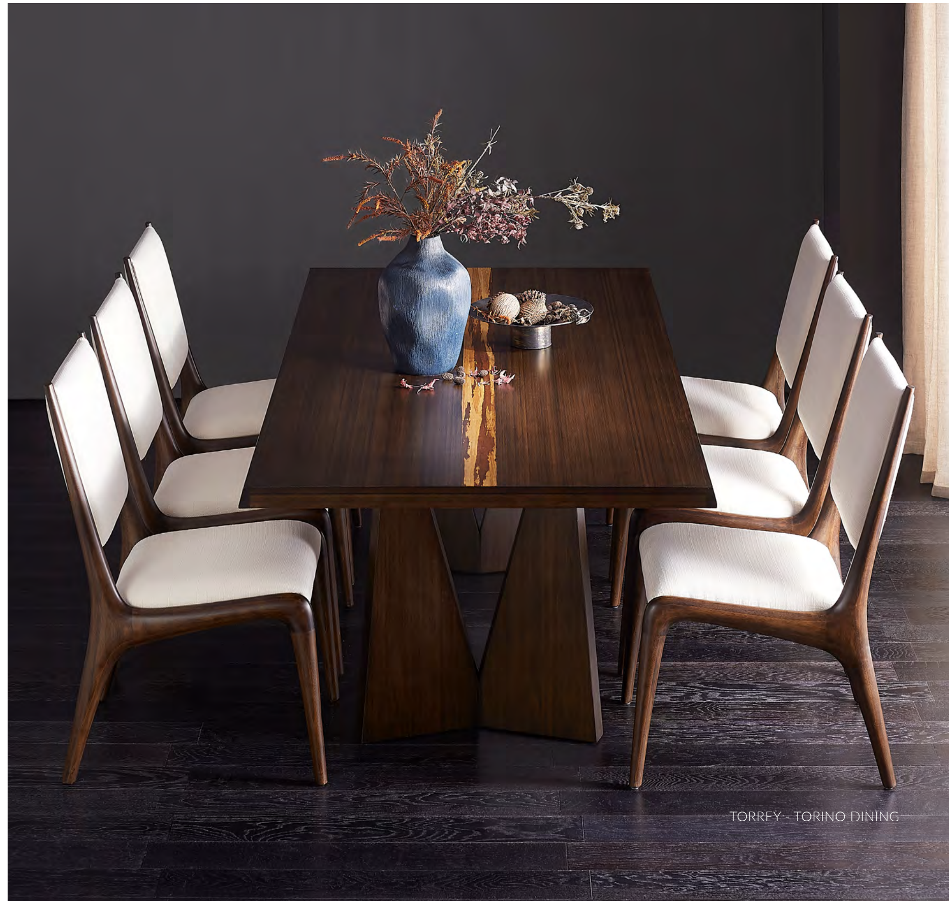
TORREY - TORINO DINING