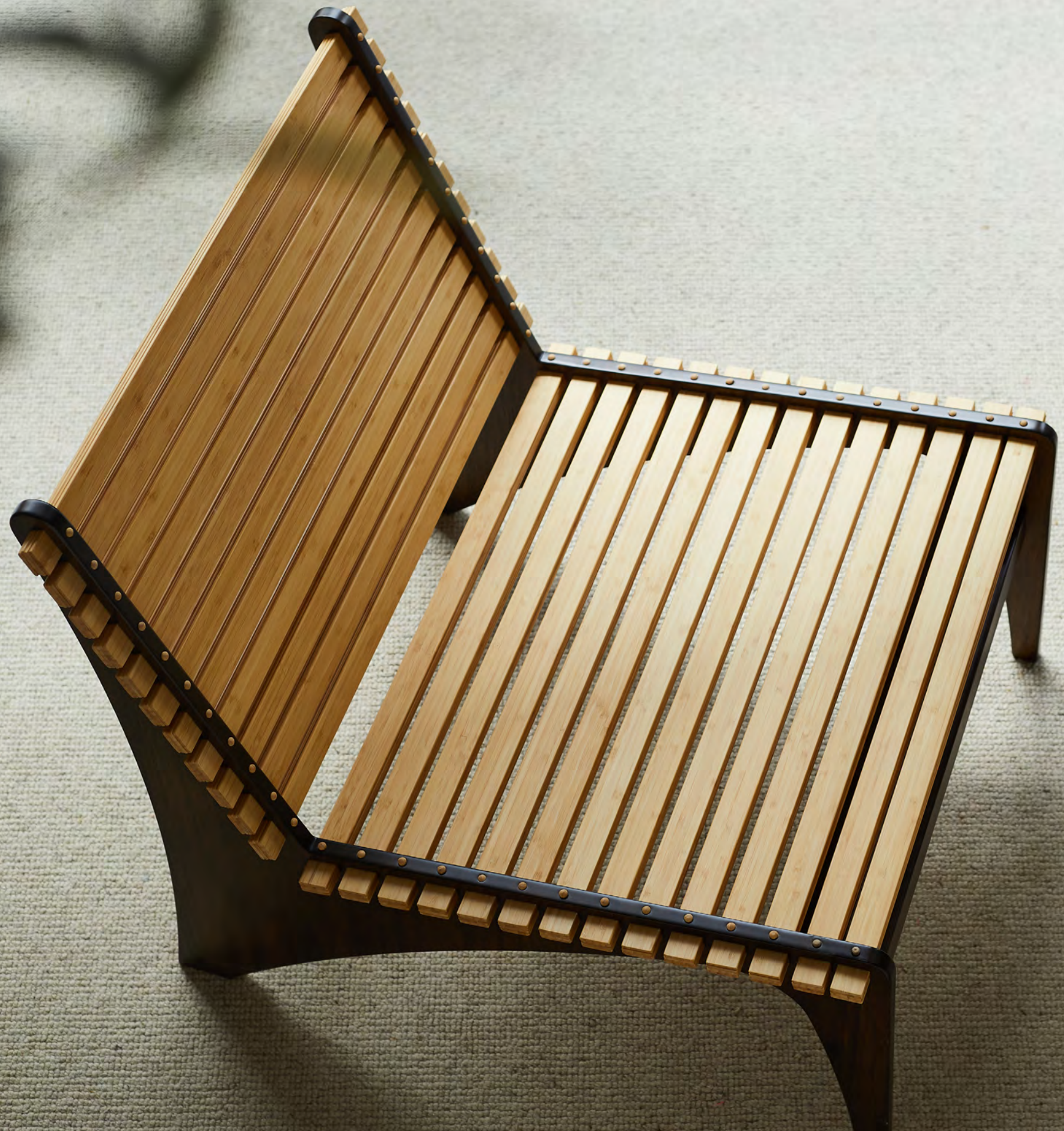
ZEN LOUNGE CHAIR