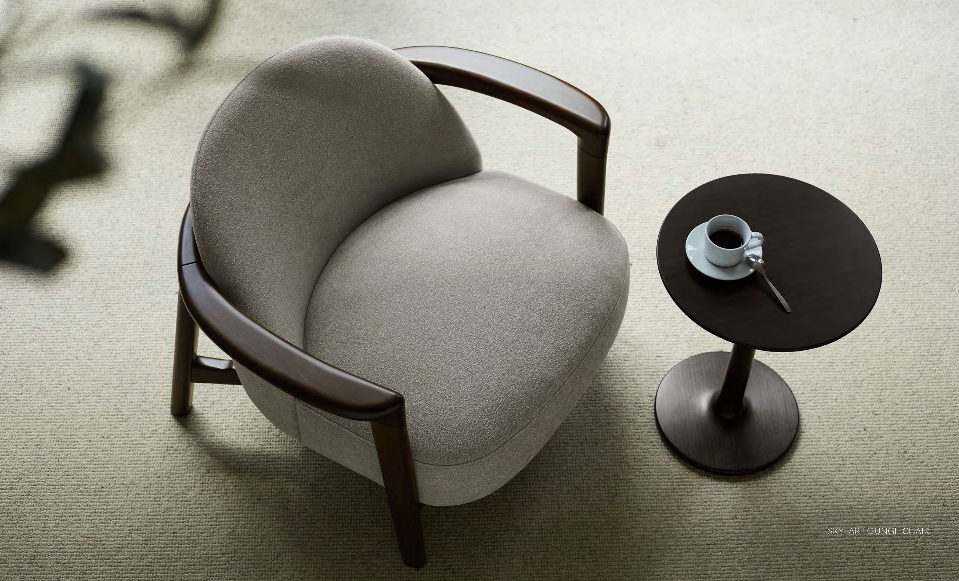
SKYLAR LOUNGE CHAIR