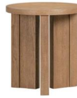
Round Drink Table