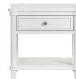
End Table MRO-AB-7-02-0 22"W x 24"D x 24"H FEATURES: Soft close drawers