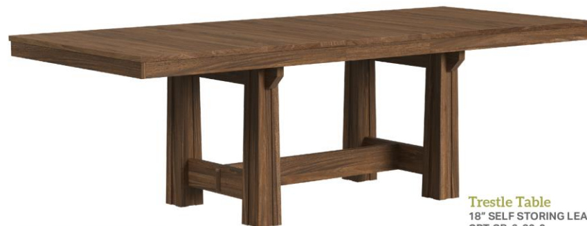
Trestle Table 18" SELF STORING LEAF CRT-SB-6-30-0 40"W x 78"-96" L x 30"H FEATURES: Self Storing Leaf

MATERIAL: MAHOGNY | FINISH: SADDLE BROWN HARDWARE: OIL RUBBED BRONZE | UPHOLSTERY: COCOA