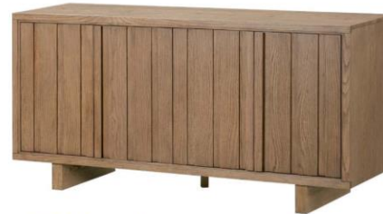
Sideboard ASV-PR-9-01-0 66"W x 32"H x 19"D

FEATURES: Cord Management, Soft Close Doors and Drawers, English Dovetail Drawer Boxes, Adjustable Shelving