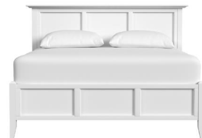
Full Panel Bed