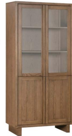
Hutch ASV-PR-9-10-0 37.5"W x 80"H x 18"D

FEATURES: Cord Management, Soft Close Doors and Drawers, English Dovetail Drawer Boxes, Adjustable Shelving