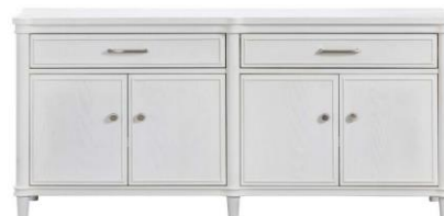
66" Media Console MRO-AB-7-70-0 66"W x 30"H x 19"D FEATURES: Cord management, adjustable shelving, soft close doors and drawers