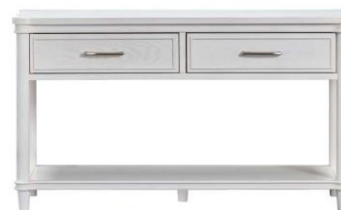
Sofa Console MRO-AB-7-21-0 52"W x 18"D x 30"H FEATURES: Soft close drawers