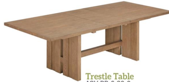
Trestle Table ASV-PR-6-30-0 40"W x 79.5"-97.75"L x 30.25"H FEATURES: Self-Storing Leaf