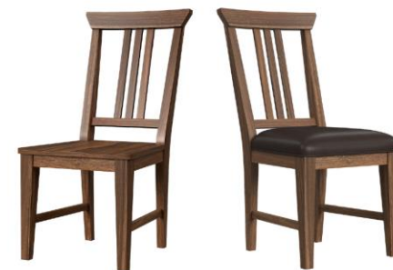
Slatback Wood Seat Chair CRT-SB-2-35-K 20"W x 39.25"H x 24.5" D FEATURES: Contoured seat for additional comfort