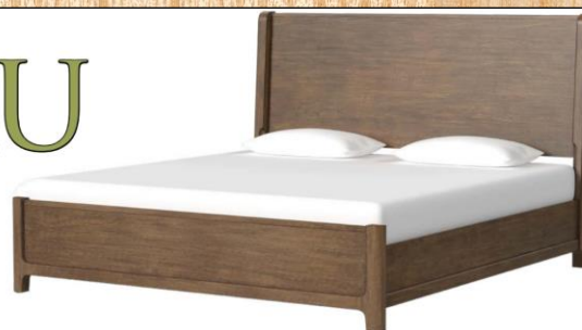
Queen Wood Panel Bed JNE-MI-5-03-0