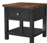
End Table STO-BL-7-01-0 23.25"W x 23.25"D x 24"H

FEATURES: English Dovetail Drawer Boxes, Full Extension Drawer Glides