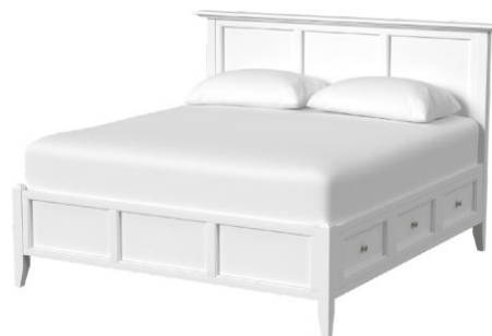
Full Storage Bed

MATERIAL: MAHOGANY | FINISH: WHITE | HARDWARE: BRUSHED NICKEL