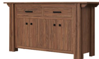
Server CRT-SB-9-01-0 66"W x 34"H x 19"D FEATURES: Felt lined top drawers, felt lined silverware tray, adjustable shelving, soft close drawer glides, cord management