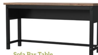
Sofa Bar Table STO-BL-7-22-0 72"W x 20"L x 36"H

FEATURES: USB Charging Station (USB A & C, dual power outlets), Cord Management, Power Strip