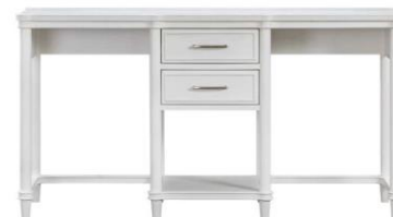
Sofa Bar Table MRO-AB-8-01-0 68"W x 20"D x 36"H FEATURES: Soft close drawers