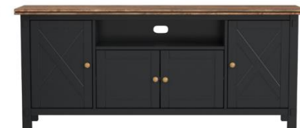
72"Media Console FEATURES: Cord Management, Adjustable Shelving STO-BL-7-71-0 72"W x 31"H x 17"