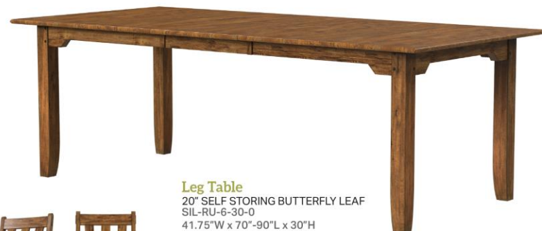
Leg Table 20" SELF STORING BUTTERFLY LEAF SIL-RU-6-30-0 41.75"W x 70"-90"L x 30"H FEATURES: Self-Storing Leaves

MATERIAL: MANGO FINISH: RUSSET HARDWARE: OIL RUBBED BRONZE UPHOLSTERY: PEARL