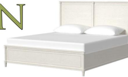
Queen Panel Bed MRO-AB-5-03-0 87"L x 64.75"W x 48"H