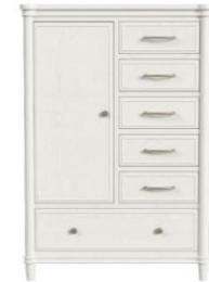
Door Chest MRO-AB-5-64-0 38"W x 55"H x 19"D

FEATURES: Soft close drawer glides, felt lined top drawer, cedar lined bottom drawer