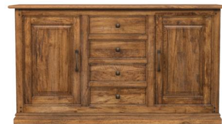
Server SIL-RU-9-01-0 58"W x 32"H x 18"D

FEATURES: Felt lined top drawers, adjustable shelving, soft close doors and drawers, cord management, stemware racks, flippable wine shelves