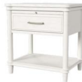
1 Drawer Nightstand MRO-AB-5-75-0 26"W x 27"H x 18"D

FEATURES: Felt lined top drawers, cedar lined bottom drawers, soft close drawer glides, sliding/removable jewelry trays