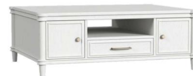
Cocktail Table MRO-AB-7-11-0 50"W x 29"D x 18"H FEATURES: Soft close doors and drawer