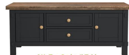
Lift Top Cocktail Table STO-BL-7-12-0 23.5"W x 50"D x 20"H FEATURES: English Dovetail Drawer Boxes, Full Extension Drawer Glides, Lift Top