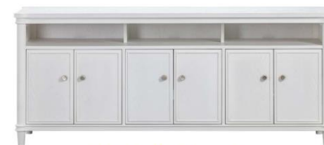
72" Media Console MRO-AB-7-71-0 72"W x 30"H x 19"D FEATURES: Cord management, adjustable shelving, soft close doors

MATERIAL: OAK VENEER FINISH: ALABASTER HARDWARE: SILVER