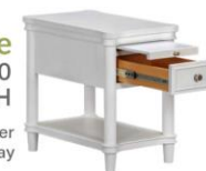
Chairside Table MRO-AB-7-01-0 16"W x 24"D x 24"H FEATURES: Soft close drawer glides, pull out melamine tray