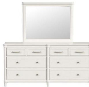
Dresser MRO-AB-5-50-0 70"W x 33.5"H x 19"D

FEATURES: Soft close drawer glides, felt lined top drawer, cedar lined bottom drawer