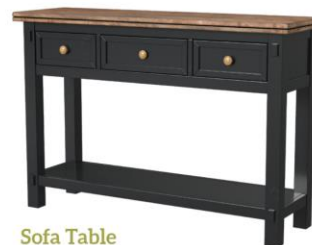
Sofa Table STO-BL-7-21-0 47.25"W x 14"D x 32"H

MATERIAL: SOLID HARDWOOD | FINISH: SLATE BLACK & CHICKORY | HARDWARE: CHICKORY FINISHED WOOD