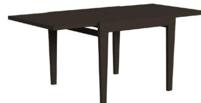
Draw Leaf Table TWO 20" EXPANDABLE LEAVES SHI-ON-6-01-0 35.5"W x 30.5"-70.5"L x 29.5"H