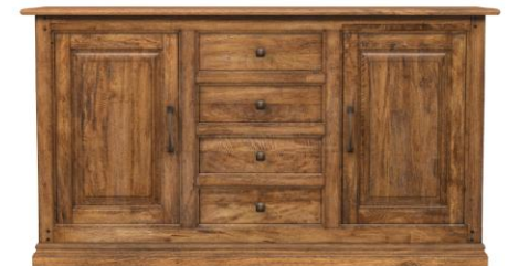
Server SIL-RU-9-01-0 58"W x 32"H x 18"D

FEATURES: Felt lined top drawers, adjustable shelving, soft close doors and drawers, cord management, stemware racks, flippable wine shelves