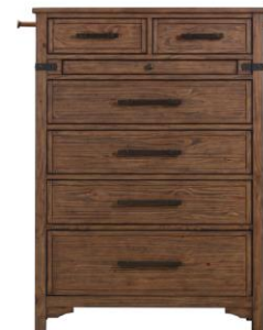
Chest STR-RB-5-60-0 44"W x 60"H x 20"D

FEATURES: Felt lined top drawer, soft close drawer glides