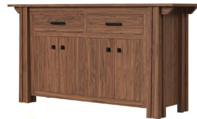
Server CRT-SB-9-01-0 66"W x 34"H x 19"D FEATURES: Felt lined top drawers, felt lined silverware tray, adjustable shelving, soft close drawer glides, cord management