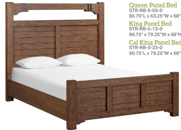
Queen Panel Bed STR-RB-5-03-0 86.75"L x 63.25"W x 68"H

FEATURES: Secret drawer, soft close drawer glides, felt lined top drawer, USB Charging Station (USB A & C, dual power outlets)