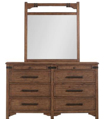
Dresser STR-RB-5-50-0 68"W x 40"H x 20"D

FEATURES: Valet pulls, soft close drawer glides, felt lined top drawer, removable felt lined jewelry tray