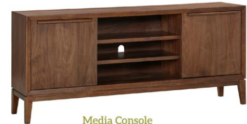
Media Console CVL-DA-7-70-0 68"W x 16"D x 30"H

FEATURES: English Dovetail Drawer Boxes, Soft Closing Glides