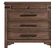
Bachelors Chest STR-RB-5-64-0 38"W x 34"H x 19.25"D

FEATURES: Felt lined top drawer, soft close drawer glides