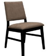
Grey UPH Chair CST-DO-2-45-K 19.25"W x 33.5"H x 22.75"D