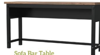
Sofa Bar Table STO-BL-7-22-0 72"W x 20"L x 36"H

FEATURES: USB Charging Station (USB A & C, dual power outlets), Cord Management, Power Strip