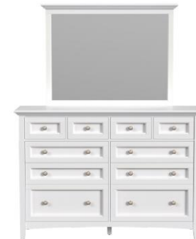
Dresser WSL-WH-5-51-0 60"W x 42"H x 18.5"D Mirror WSL-WH-5-56-0 45"W x 33.75"H x 2"D FEATURES: English Dovetail Drawer Boxes, Felt Lined Top Drawers, Beveled Mirror