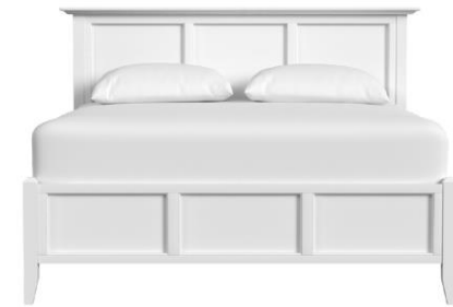
Full Panel Bed WSL-WH-5-43-0 80"L x 58"W x 49.75"H