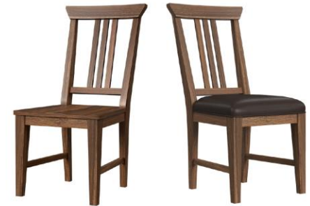
Slatback Wood Seat Chair CRT-SB-2-35-K 20"W x 39.25"H x 24.5" D FEATURES: Contoured seat for additional comfort