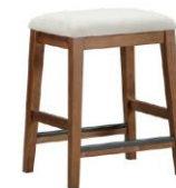
Sofa Bar Stool CVL-DA-3-17-K 20"W x 16"D x 25.25"H

FEATURES: English Dovetail Drawer Boxes, Soft Closing Glides, USB Charging Station, Cord Management, Power Strip