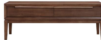
Coffee Table CVL-DA-7-11-0 52"W x 28"D x 19"H

MATERIAL: WALNUT VENEER | FINISH: DARK AMBER | HARDWARE: WALNUT | UPHOLSTERY: VANILLA