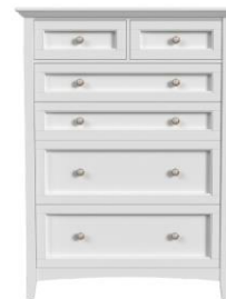
Chest WSL-WH-5-60-0 40"W x 53.42"H x 18.5"D FEATURES: English Dovetail Drawer Boxes, Felt Lined Top Drawers