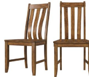
Slatback Wood Seat Chair SIL-RU-2-65-K 19.25"W x 39.5"H x 23"D FEATURES: Contoured seat for additional comfort