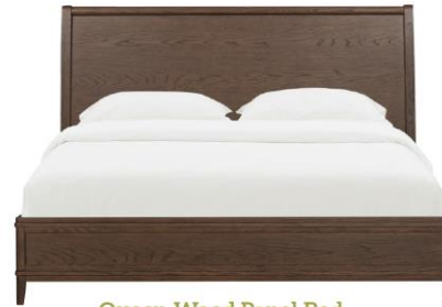
Queen Wood Panel Bed

MATERIAL: OAK | FINISH: JACOBEOAN | HARDWARE: MATTE BLACK | UPHOLSTERY: CREAM