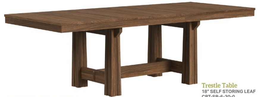
Trestle Table 18" SELF STORING LEAF CRT-SB-6-30-0 40"W x 78"-96" L x 30"H FEATURES: Self Storing Leaf

MATERIAL: MAHOGNY | FINISH: SADDLE BROWN HARDWARE: OIL RUBBED BRONZE | UPHOLSTERY: COCOA