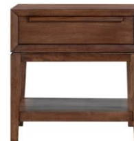
End Table CVL-DA-7-02-0 24"W x 24"D x 24.75"H

FEATURES: English Dovetail Drawer Boxes, Soft Closing Glides