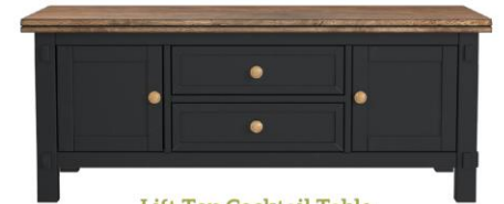
Lift Top Cocktail Table STO-BL-7-12-0 23.5"W x 50"D x 20"H FEATURES: English Dovetail Drawer Boxes, Full Extension Drawer Glides, Lift Top