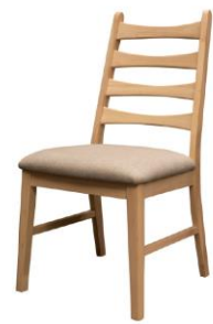
Gray UPH Chair CST-DO-2-98-K 19"W x 38"H x 24.5"D