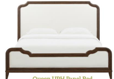
Queen UPH Panel Bed