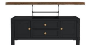
Lift Top Coffee Table with top opened

FEATURES: English Dovetail Drawer Box, Full Extension Drawer Glides, USB Charging Station (USB A & C, dual power outlets), Cord Management