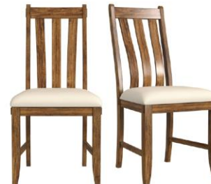
Slatback UPH Seat Chair SIL-RU-2-35-K 19.25"W x 39.5"H x 23.25"D FEATURES: Pirelli webbed seats for additional comfort and support