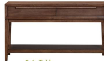
Sofa Table CVL-DA-7-21-0 52"W x 18"D x 29.25"H

FEATURES: English Dovetail Drawer Boxes, Soft Closing Glides