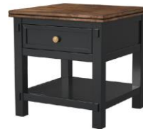
End Table STO-BL-7-01-0 23.25"W x 23.25"D x 24"H

FEATURES: English Dovetail Drawer Boxes, Full Extension Drawer Glides