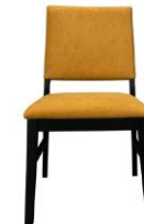
Mustard UPH Chair CST-DO-2-69-K 19.25"W x 33.5"H x 22.75"D