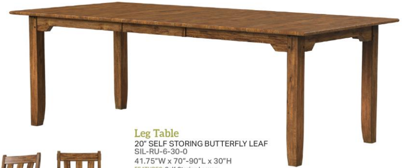
Leg Table 20" SELF STORING BUTTERFLY LEAF SIL-RU-6-30-0 41.75"W x 70"-90"L x 30"H FEATURES: Self-Storing Leaves

MATERIAL: MANGO FINISH: RUSSET HARDWARE: OIL RUBBED BRONZE UPHOLSTERY: PEARL