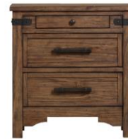
Nightstand STR-RB-5-75-0 27"W x 28"H x 18"D

MATERIAL: SOLID PINE | FINISH: RECLAIMED BARN | HARDWARE: OIL RUBBED BRONZE