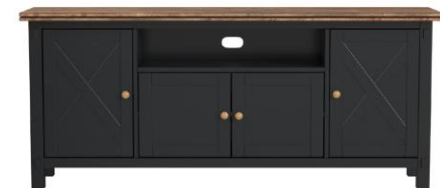
72" Media Console STO-BL-7-71-0 72"W x 31"H x 17.25"D FEATURES: Cord Management, Adjustable Shelving