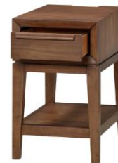
Chairside Table CVL-DA-7-01-0 14.75"W x 24"D x 24"H

FEATURES: Cord Management, Adjustable Shelving