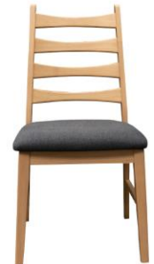
Navy UPH Chair CST-DO-2-55-K 19"W x 38"H x 24.5"D