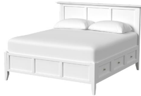
Full Storage Bed WSL-WH-5-43-1 80"L x 58"W x 49.75"H

MATERIAL: MAHOGANY | FINISH: WHITE | HARDWARE: BRUSHED NICKEL