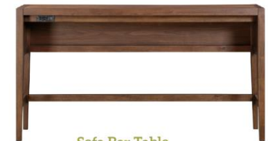
Sofa Bar Table CVL-DA-8-01-0 68"W x 20"D x 36"H

FEATURES: English Dovetail Drawer Boxes, Soft Closing Glides