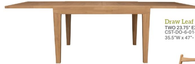
Draw Leaf Table TWO 23.75" EXPANDABLE LEAVES CST-DO-6-01-0 35.5"W x 47" - 94.5"L x 29.5"H

MATERIAL: OAK VENEER & MDF FINISH: DOVE UPHOLSTERY: NAVY OR GRAY