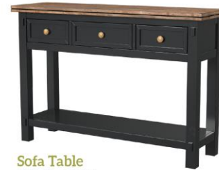
Sofa Table STO-BL-7-21-0 47.25"W x 14"D x 32"H

MATERIAL: SOLID HARDWOOD | FINISH: SLATE BLACK & CHICKORY | HARDWARE: CHICKORY FINISHED WOOD